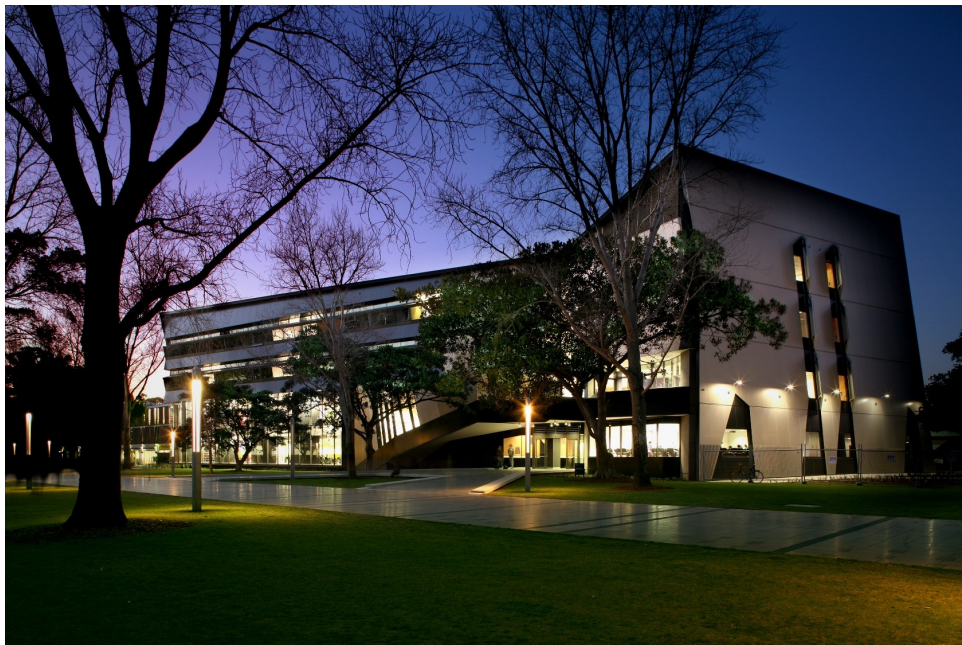
UNSW Law School, Kensington, NSW

UNSW Law School, University of New South Wales Kensington, Sydney, NSW, Australia